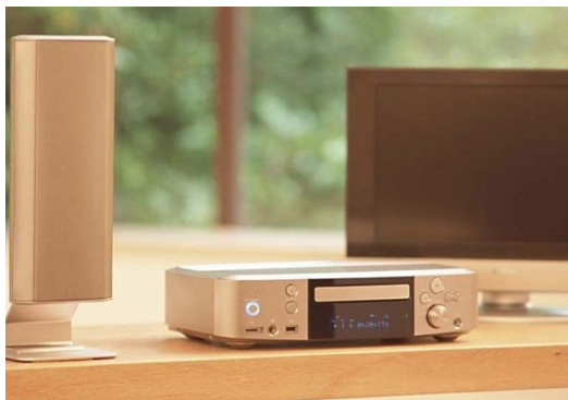
Figure 2: Home theatre system

A world-leading audio systems maker has taken advantage of the excellent audio and signal coupling performance of OxiCap capacitors in its latest home theatre system. The other big advantage of AVX' capacitors which the maker considered was their low profile construction compared to traditional aluminium electrolytic capacitors. Its home theatre system is shown in figure 2, with figure 3 showing the main board with orange OxiCap capacitors.