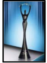
Electra Award 2005